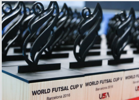
Souvenir Participation Award for every player & coach