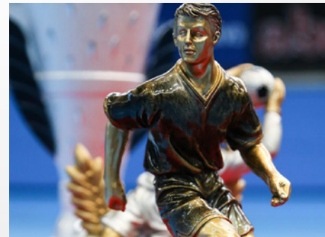
Best Goalkeeper, Highest Goalscorer & Most Valuable Player awards in each category