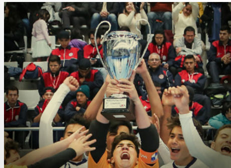
1st, 2nd & 3rd Trophies & Medals